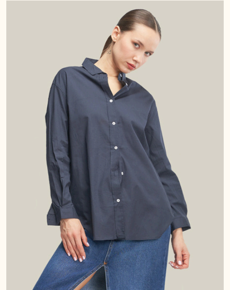
COLOR: NAVY BLUE

FABRIC TYPE: Cotton HEIGHT: Standard FORM: Oversize SLEEVE TYPE: Long