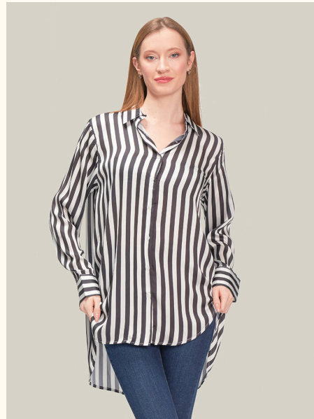
COLOR: BLACK-WHITE STRIPED

FABRIC TYPE: Satin HEIGHT: Standard FORM: Oversize SLEEVE TYPE: Long