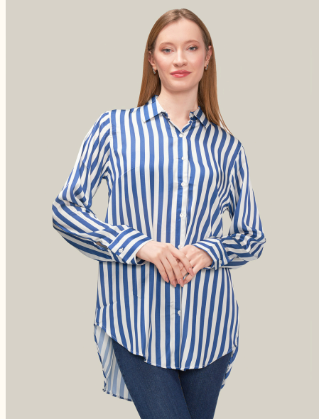
COLOR: BLUE-WHITE STRIPED